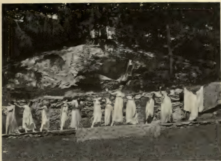
A FRIEZE ( The Magic of the Hills —Dartmouth)